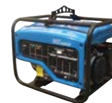
Lifting Bail 1560179500

for all TPG4 generators & TE/EPT/THP engine pumps* *excluding TPG4-3000HDX