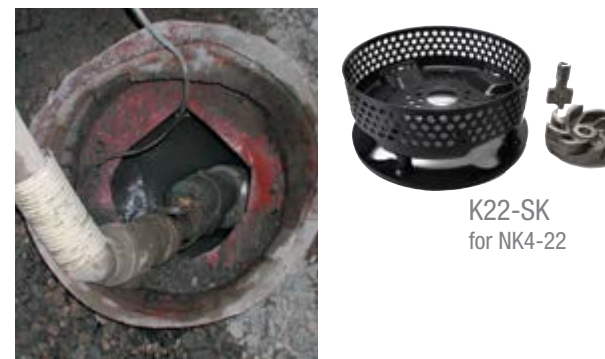
K22-SK for NK4-22