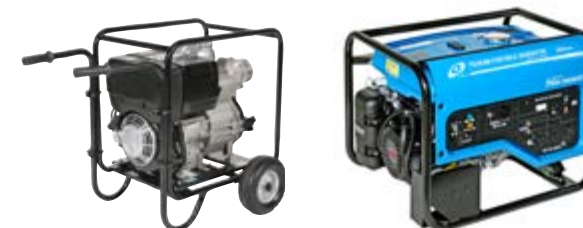
Wheel Kit PGWK-HX for TPG4 Series Generator & Gas Engine Pumps

Heavy-duty and easy to install our wheel kits, and lifting bails fit Tsurumi engine pumps & generators.