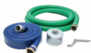
Hose Kit with NPT