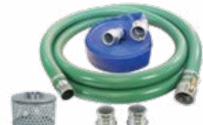
Hose Kit with Quick Connect