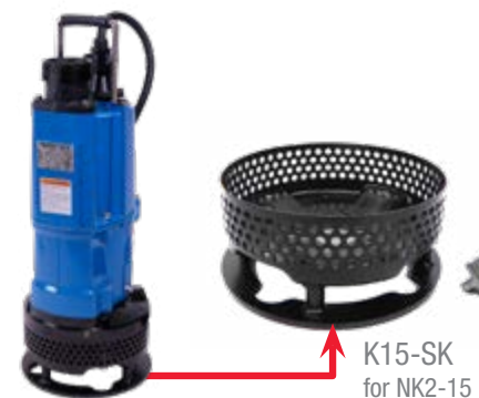
K15-SK for NK2-15

The Sand Kit can be added to the NK Series to suspend sand and prevent sand lock.